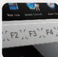
Touchable Function Keypad