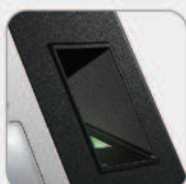
ZK Optical Fingerprint Sensor